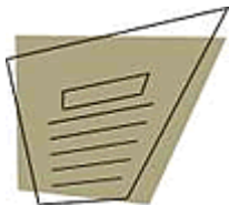
Percussion and Drumline